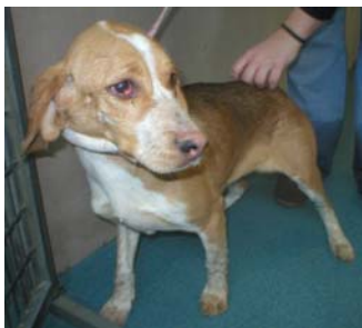
"Lady Bird" was found abandoned and frostbitten in the woods. Her rescuer brought her to SSHS, where she was nursed back to health.

Don't let their furry coats fool you – companion animals need human help to stay safe in the cold weather. Although indoors is best, the Stevens-Swan Humane Society has tips for keeping our domestic pets safe in the frigid, unforgiving upstate winter.