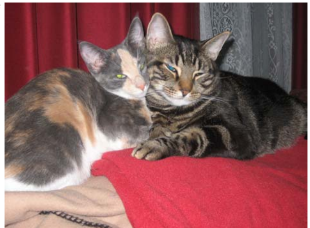
“Alice,” left, came to Stevens-Swan at 2 weeks old. She was fostered, and then adopted into a home where she met her best friend “Jack,” right, who came from SSHS as a kitten in 2002.

abandoned and abused animals in this community.